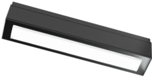
Broadband LED lighting bar - BlackBright Optimised for combined use with BlackIndustry